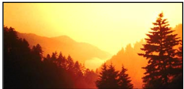
Great Smoky Mountains serenity