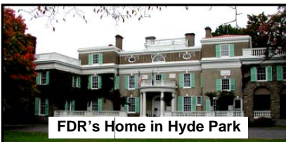
FDR's Home in Hyde Park

DAY 2: Enjoy the breakfast choice of cereals, fruits, and omelette before heading out with our guide to Hyde Park to visit the home and museum of four-term President Franklin D. Roosevelt. Stop for lunch (on your own) nearby at the Eveready Diner, a stylish 1950s-style eatery with an extensive menu. Then tour decidedly upscale surroundings when you visit the 54-room