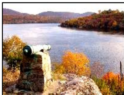
Hudson River near West Point

CANCELLATION/INTERRUPTION INSURANCE: We recommend you purchase insurance so if you have to cancel your reservation due to illness or a death in the family, you will be able to file an insurance claim to get your money refunded. If purchased within 7 days of your initial payment, pre-existing medical conditions will be waived. The cost is $48 per person based on double occupancy. Please fill out, sign, and return form to our office with your check payable to Red Lion Tours & Travel. Call if you would like additional information.