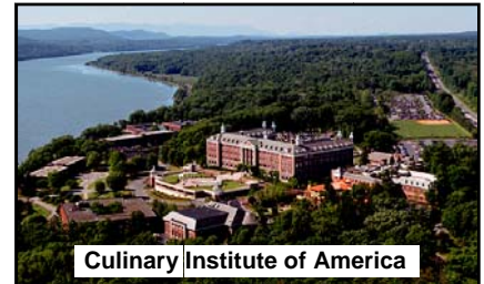
Culinary Institute of America

Vanderbilt Mansion, a remarkably complete example of a Gilded Age country place. Afterward, stroll among the shops in the historic little town of Rhinebeck, where settlement began in 1686. Arrive later this afternoon at the Culinary Institute of America, where many famous chefs have acquired their skills. Enjoy a tour of this premier culinary college in its lovely setting above the Hudson before delighting in dinner on campus at the Ristorante Caterina