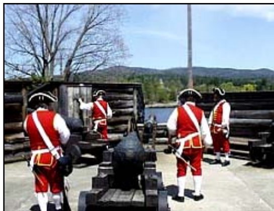
Still fighting the French & Indian War at Fort William Henry

CANCELLATION/INTERRUPTION INSURANCE: We recommend you purchase insurance so if you have to cancel your reservation due to illness or a death in the family, you will be able to file an insurance claim to get your money refunded. If purchased within 7 days of your initial payment, pre-existing medical conditions will be waived. The cost is $48 per person based on double occupancy. Please fill out, sign, and return form to our office with your check payable to Red Lion Tours & Travel. Call if you would like additional information.