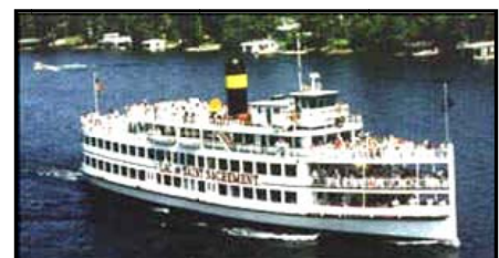
Lac du Saint Sacrement Cruise Ship