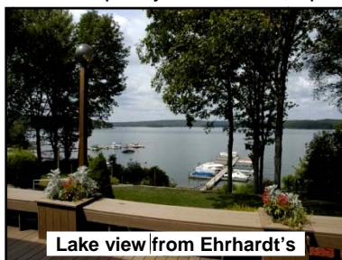
Lake view from Ehrhardt's

Arriving in the pretty Poconos, enjoy coffee and apple streusel at the popular Ehrhardt's Banquet Center on the shore of pretty Lake Wallenpaupack. Take a leisurely stroll outside by the lake, and enjoy music and dancing