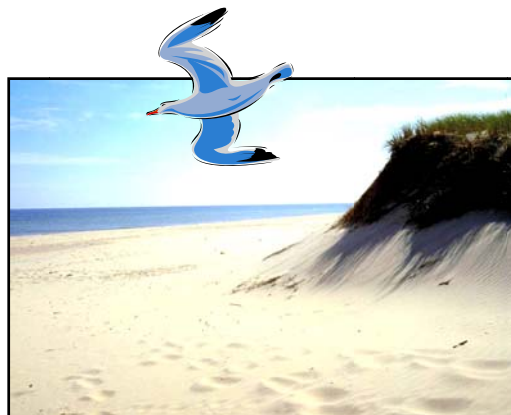
Explore beautiful Cape Cod!

CANCELLATION/INTERRUPTION INSURANCE: We recommend you purchase insurance so if you have to cancel your reservation due to illness or a death in the family, you will be able to file an insurance claim to get your money refunded. If purchased within 7 days of your initial payment, pre-existing medical conditions will be waived. The cost is $48 per person based on double occupancy. Please fill out, sign, and return form to our office with your check payable to Red Lion Tours & Travel. Call if you would like additional information.