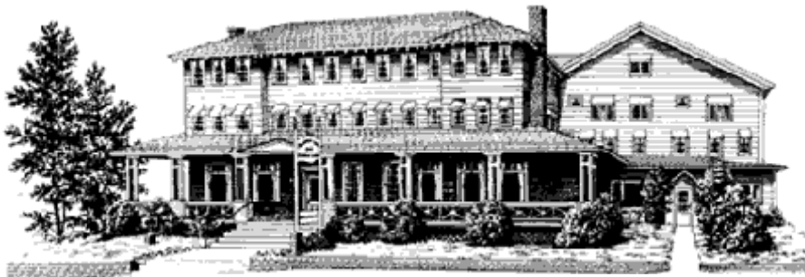
Rangeley Inn in Maine's Moose Country

DAY 5: After a continental breakfast, head home with marvelous memories of mighty moose and the beautiful coast of Maine. Expected arrival in Lancaster is 6:45 PM, York 7:30 PM, Red Lion 8:00 PM. (breakfast)