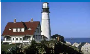
Portland Head Lighthouse

DAY 3: Enjoy breakfast at the inn before meeting a local prospector on the banks of the Swift River and trying your hand at gold panning. Relax over a picnic lunch, then enjoy a leisurely canoe ride with our guides on the calm lake to get glimpses of local wildlife. Back at the inn, delight in the chain saw mastery of the legendary "Mad Whittler" as he carves amazing figures in wood. After dinner, motor around the lake with our guide at dusk (the best time for spotting moose) to look for the antlered animals in likely places. (breakfast, lunch, dinner)