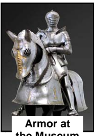
Armor at the Museum

DEPOSIT/FINAL PAYMENT/CANCELLATIONS: A deposit of $40 is due within 10 days of booking. Seat assignments are made based upon when we receive payment for your booked tour. Balance due May 14, 2010 . Cancellation date is May 14, 2010 . Full refund will be given if cancelled by this date except for some tours such as Broadway Shows and Nascar, etc. These may involve non-refundable payments. There is a fee of $40 per person for cancellations received after this date. Plus any money for tour features or services paid to suppliers for your reservation, that is not refunded to Red Lion, can not be refunded to you. This includes any expenses we incur as a result of the cancellation. NO REFUND for cancellations received within 48 hours of tour departure. All cancellation calls must be received during regular office hours, no voice mail messages. NO REFUNDS for failure to show up on day of tour. SORRY – NO EXCEPTIONS! Any refunds will be paid after tour has completed and refunds have been received from suppliers by Red Lion.