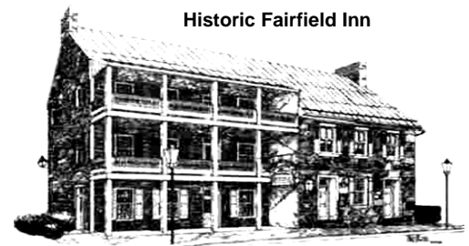
Historic Fairfield Inn

DEPOSITS/FINAL PAYMENT/CANCELLATIONS: A deposit of $40 is due within 10 days of booking. Balance due June 7, 2010 . Seat assignments are made based upon when we receive payment for your booked tour. Cancellation date is June 7, 2010 . Full refund will be given if cancelled by this date. There is a fee of $40 per person for cancellations received after this date. Plus any money for tour features or services paid to suppliers for your reservation, that is not refunded to Red Lion, can not be refunded to you. This includes any expenses we incur as a result of the cancellation. NO REFUND for cancellations received within 48 hours of tour departure. All cancellation calls must be received during regular office hours, no voice mail messages. NO REFUNDS for failure to show up on day of tour. SORRY – NO EXCEPTIONS! Any refunds will be paid after tour has completed and refunds have been received from suppliers by Red Lion.