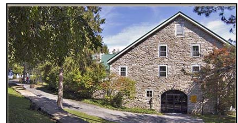
Fairfield Hall at Allenberry Resort

CANCELLATION/INTERRUPTION INSURANCE: We recommend you purchase insurance so if you have to cancel your reservation due to illness or a death in the family, you will be able to file an insurance claim to get your money refunded. If purchased within 7 days of your initial payment, pre-existing medical conditions will be waived. The cost is $13 per person. Please fill out, sign, and return form to our office with your check payable to Red Lion Tours & Travel. Call if you would like additional information.