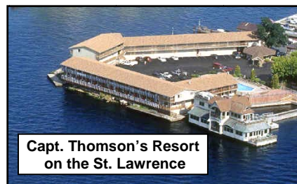
Capt. Thomson's Resort on the St. Lawrence

DAY 2: Breakfast at Riley's is followed by another delightful Uncle Sam cruise. Stop along the way at Dark Island to tour magnificent and mysterious Singer Castle, built with secret passages by a sewing machine tycoon. The