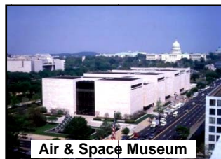
Air & Space Museum

PAYMENT/CANCELLATIONS: Full payment due within 10 days of booking. Seat assignments are made based upon when we receive payment for your booked tour. Cancellation date is July 30, 2010 . Full refund will be given if cancelled by this date. There is a fee of $40 per person for cancellations received after this date. Plus any money for tour features or services paid to suppliers for your reservation, that is not refunded to Red Lion, can not be refunded to you. This includes any expenses we incur as a result of the cancellation. NO REFUND for cancellations received within 48 hours of tour departure. All cancellation calls must be received during regular office hours, no voice mail messages. NO REFUNDS for failure to show up on day of tour. SORRY – NO EXCEPTIONS! Any refunds will be paid after tour has completed and refunds have been received from suppliers by Red Lion.