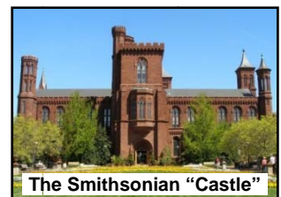
The Smithsonian "Castle"

CANCELLATION/INTERRUPTION INSURANCE: We recommend you purchase insurance so if you have to cancel your reservation due to illness or a death in the family, you will be able to file an insurance claim to get your money refunded. If purchased within 7 days of your initial payment, pre-existing medical conditions will be waived. The cost is $13 per person. Please fill out, sign, and return form to our office with your check payable to Red Lion Tours & Travel. Call if you would like additional information.