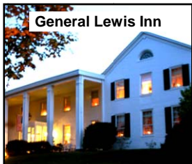
General Lewis Inn

DAY 1: Traveling to the scenic Greenbrier Valley in the Allegheny Mountains of West Virginia, head first to the new Fairfield Inn (304-645-7999) in Lewisburg, WV, which will be our home for two nights. Here we will meet our local guide and continue on to the Lost World Caverns, where we will descend 120 feet below the surface to