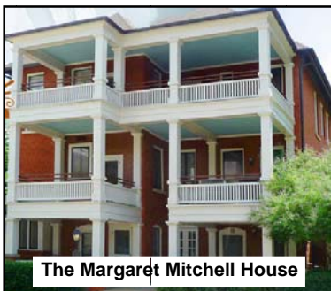
The Margaret Mitchell House

DAY 2: Enjoy a hot buffet breakfast at the hotel, then continue south to Atlanta. Stop first at the marvelous Atlanta History Center, where you will learn all about Atlanta, from its earliest settlers through Civil War history to its present international fame. Enjoy lunch on your own