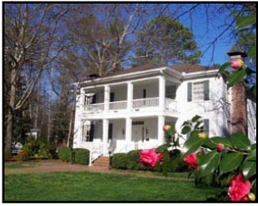
Stately Oaks Plantation

DAY 4: After the hot continental breakfast at the hotel, head to charming Madison, “the town that Sherman refused to burn,” which we tour with a local guide, visiting historic homes including Heritage Hall. Continuing our pretty drive, motor through historic Watkinsville, stopping at the State Botanical Garden, a living laboratory operated by the University of Georgia. Enjoy lunch on your own at the Garden Café before motoring into charming Athens, home to the University of Georgia. In the company of a local guide, travel down Milledge Street among beautiful old homes. At the Butts-Mehre Heritage Hall Sports Museum, named for a pair of legendary Bulldog coaches, celebrate the university’s football history. Then it’s time to bid Georgia goodbye, and head north. For a restful stopover, stay at the Fairfield Inn in Gastonia, NC (704-867-5073). Enjoy dinner nearby this evening.