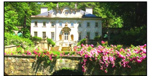
Swan House at Atlanta History Center

PACKAGE INCLUDES: Deluxe Motorcoach transportation, 4 nights accommodations, 4 breakfasts, 1 lunch, 4 dinners, including one at Mary Mac’s Tearoom in Atlanta and one at Stately Oaks Plantation with costumed storyteller, Atlanta History Center, with tour of Swan House and self-guided tour of Tullie Smith Farm, Margaret Mitchell House and Museum, Road to Tara Museum, Gone With The Wind tour of Jonesboro, tour at National Archives Southeast Region, at least two historic homes including Heritage Hall in Madison, State Botanical Garden, Milledge Street in Athens, and Butts-Mehre Heritage Hall Sports Museum, baggage handling, guides, and escort.