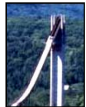
Ride up the Jump Tower!

DAY 4: Enjoy a final breakfast at the Marriott and say farewell to Lake Placid as we head for home with bright memories of the incredible beauty of the Adirondacks. Expected arrival in Lancaster at 7:15 PM, York 8:00 PM, Red Lion 8:30 PM.