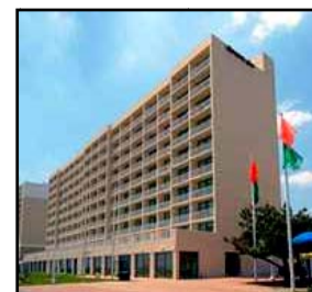
Hampton Inn South Oceanfront

DAY 1: Head south to Virginia Beach, Virginia, for the 37th Annual Neptune Festival, a celebration of the city's seafaring heritage and the grand finale of its summer season. King Neptune and his royal court preside over the big event, which includes days and nights filled with festivities, food, and fun. Arriving in Virginia Beach early in the afternoon, check into the Hampton Inn Virginia Beach Oceanfront South (757-965-2300), where you will enjoy an oceanfront room with a private balcony. Located on 10 th Street at the beach, the hotel is well positioned for Festival fun. Enjoy dinner this evening at Captain George's Famous Seafood Restaurant. (dinner)