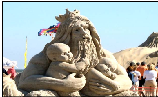
Enjoy an amazing Sandsculpting Competition!

CANCELLATION/INTERRUPTION INSURANCE: We recommend you purchase insurance so if you have to cancel your reservation due to illness or a death in the family, you will be able to file an insurance claim to get your money refunded. If purchased within 7 days of your initial payment, pre-existing medical conditions will be waived. The cost is $32 per person based on double occupancy. Please fill out, sign, and return form to our office with your check payable to Red Lion Tours & Travel. Call if you would like additional information.