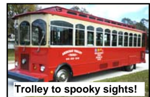
Trolley to spooky sights!

DEPARTURES: CAPE HORN (Red Lion): 7:00 AM QUEENSGATE (York): 7:30 AM GRANDVIEW PLAZA (Lancaster): 8:15 AM