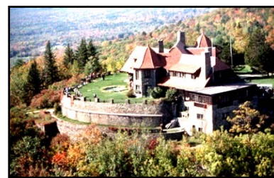
Castle in the Clouds

DAY 4: Enjoy a continental breakfast, then motor up a mountain to tour the Castle in the Clouds, an impressive mansion with awesome views. Stop in the village of Moultonboro to visit a classic New England country store and a small historical museum before boarding the M/S Mount Washington for a cruise on beautiful Lake Winnepesaukee, the state's largest lake. Enjoy dramatic scenery highlighted by the captain's commentary. Afterward, turn back the clock to relive life in America during World War II at the Wright Museum. In the evening, ride the rails through Mount Washington Valley, enjoying dinner aboard the train as the lovely scenery rolls by. (breakfast, dinner)