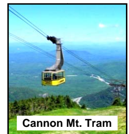
Cannon Mt. Tram