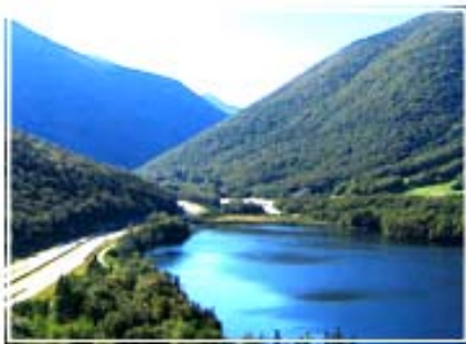
White Mountains of New Hampshire

DAY 3: Enjoy the continental breakfast at the resort before traveling inland through scenic southwestern Maine to reach the glorious White Mountains of New Hampshire just at the time when Fall colors usually begin to blaze. In North Conway, we'll meet the local guide who will lead us on a full day of touring in the White Mountain National Forest and Mount Washington Valley. You will see covered bridges, scenic waterfalls, dramatic vistas, and classic New England architecture. Travel through Crawford Notch, and view the historic Mt. Washington Hotel, a grand facility in a magnificent mountain setting. Enjoy shopping and lunch on your own in quaint North Woodstock, NH. Travel through Franconia Notch State Park, and board an enclosed tram to reach the summit of Cannon Mountain. Reaching beautiful Lake Winnepesaukee, check into the Margate Resort (603-524-5210) on the water's edge, where we will stay two nights. Enjoy dinner nearby this evening. (breakfast, dinner)