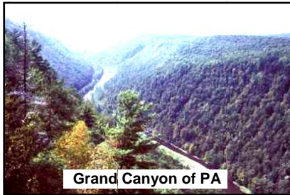
Grand Canyon of PA

Arrive in pretty little Wellsboro, the gateway to adventure in the Grand Canyon area of Pennsylvania. With its fine old homes, gas lamps, and town green, you may think you have stumbled on a New England village. Our guide joins us here before we motor nearby to Antlers Inn, a longtime local favorite in Ansonia. Fortify yourself with a bountiful luncheon buffet, including dessert.