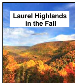
Laurel Highlands in the Fall

Head west to Pennsylvania's scenic Laurel Highlands to reach historic Ligonier, where the British defeated the French in a crucial battle in 1758.