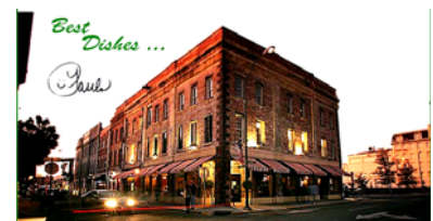
Paula Deen's Lady & Sons Restaurant