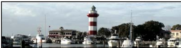
Harbour Town on Hilton Head Island

DAY 4: After breakfast at the hotel, a local guide joins us for a tour of Hilton Head Island, followed by free time for shopping and lunch on your own. In the afternoon, delight in a Dolphin Watch Cruise, followed by free time in Harbour