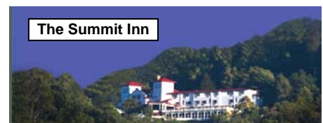
The Summit Inn

CANCELLATION/INTERRUPTION INSURANCE: We recommend you purchase insurance so if you have to cancel your reservation due to illness or a death in the family, you will be able to file an insurance claim to get your money refunded. If purchased within 7 days of your initial payment, pre-existing medical conditions will be waived. The cost is $19 per person. Please fill out, sign, and return form to our office with your check payable to Red Lion Tours & Travel. Call if you would like additional information.