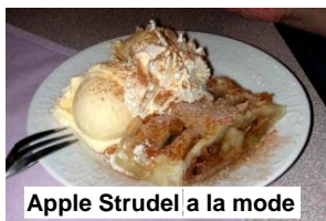
Apple Strudel a la mode

DEPOSIT/FINAL PAYMENT/CANCELLATIONS: A deposit of $40 is due within 10 days of booking. Seat assignments are made based upon when we receive payment for your booked tour. Balance due by October 5, 2010 . Cancellation date is October 5, 2010 . Full refund will be given if cancelled by this date. There is a fee of