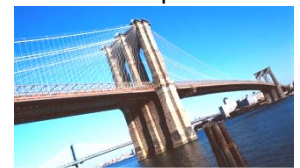
Stroll the Brooklyn Bridge!

DAY 2: This Sunday morning, you're welcome to join our fun tour to the Lower East Side. Delight in a leisurely mile-long stroll across the world-famous Brooklyn Bridge, enjoying fabulous views, and visit the colorful shops at South Street Seaport for Christmas shopping. If you like, enjoy lunch in the scenic seaport before returning to the Times Square area. Explore more of the great city on your own this afternoon, with departure from the hotel at 5:00 PM. (Please plan to eat before departure because we only make a brief rest stop on the way home.) Bring back bright memories of a magical weekend in Manhattan, with expected arrival in Lancaster at 8:45 PM, York 9:30 PM, and Red Lion 10:00 PM.